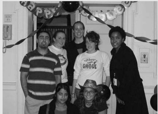
Mentors and a CAP staffer pose together during the Cole-to-Teen Halloween party.